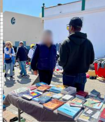
Hecho a mano